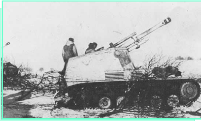
The Wespe and its nasty stinger.

The SdKfz 124 Wespe (German for "wasp"), also known as Leichte Feldhaubitze 18 auf Fahrgestell Panzerkampfwagen II ("Light field howitzer 18 on Panzer II chassis"), was a German self-propelled artillery vehicle developed and used during the Second World War. It was based on the Panzer II tank.